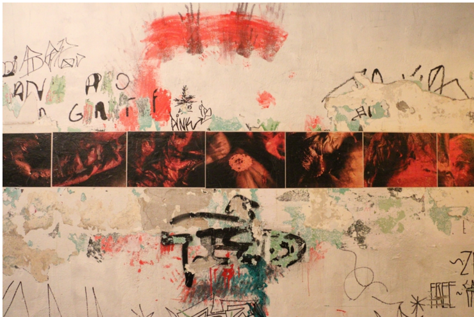
Photo exhibition, object-sculpture (watermelon dehydrated in an oven 40°-60° for 40 days), dehydrated watermelon and other fruits for ingestion, thank-you pamphlet and country music show with feedback and noise interventions. With Marco Antônio Gonçalves, 2015. [more photos, opening show]. [ more photos , opening show ]